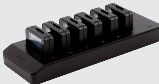
Six Port Link Dock (Optional)