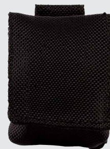
Pouch with Belt Loop