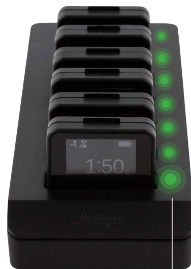
Device Charging Indicator Light

Note: These estimates are based on average device usage parameters. More frequent use of wireless communication will result in reduced battery life.