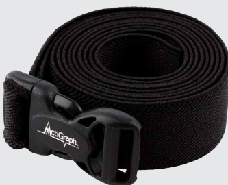
Waist Belt (Optional)