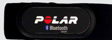
Heart Rate Monitor (Optional)