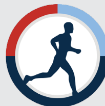
ActiLife software (version 6.11.5 or higher)