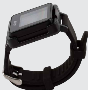
Link Wrist Band