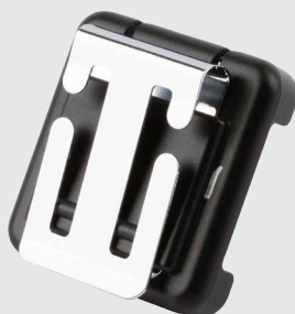
Link Belt Clip