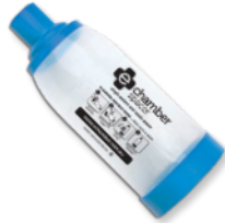
Turbo 220ml Neonate, Infant, Child and Adult