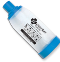
La Grande 510ml Adult